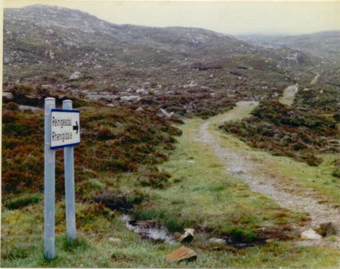
Rhenigidale Track End 1989