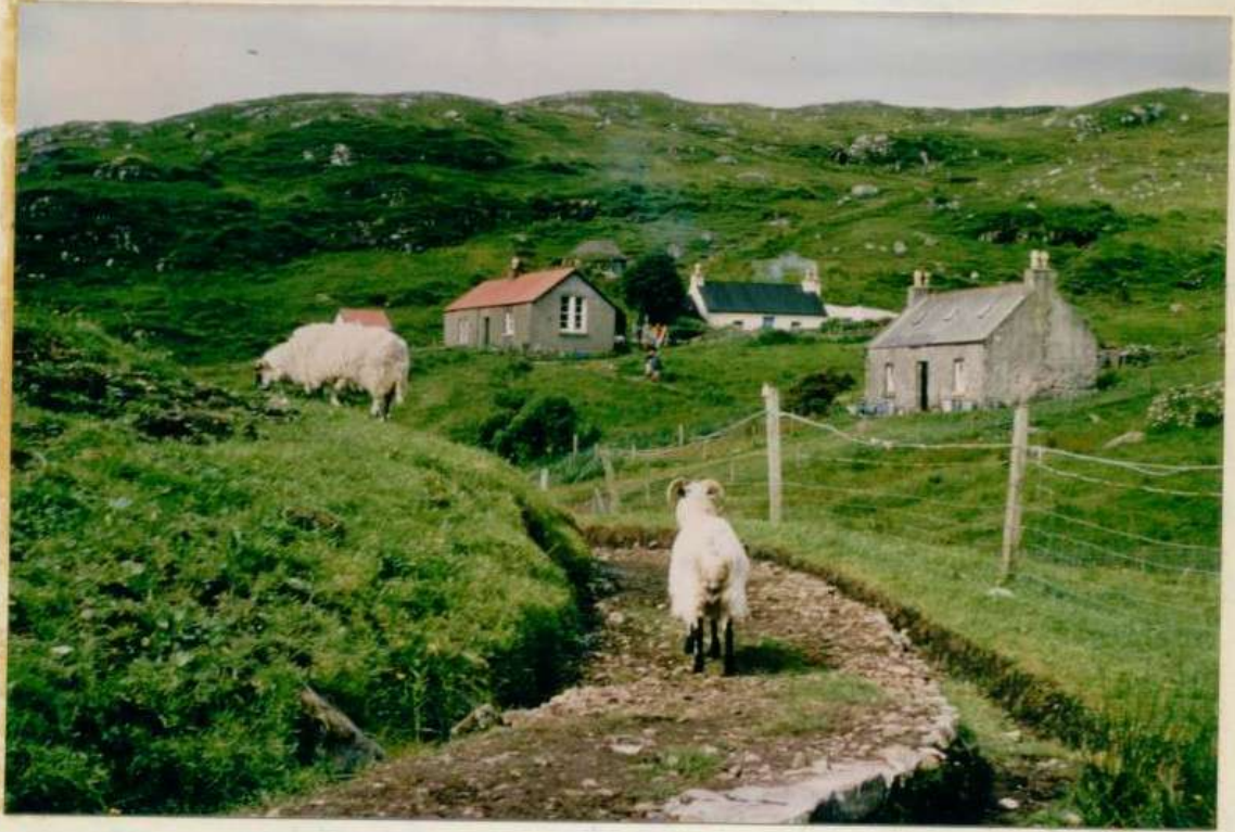
Rhemigadale High Street