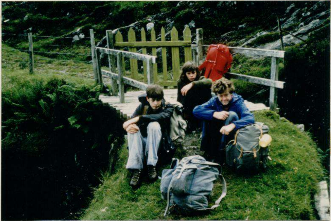
The road to Rhenigadale